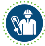
Architects & Engineers

CUSTOMER BASE: EXSISTING: Over 400 running customers PROJECTS: Completed over 2000 sites